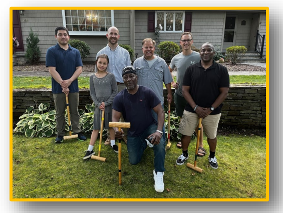
The Labor Day Croquet Team