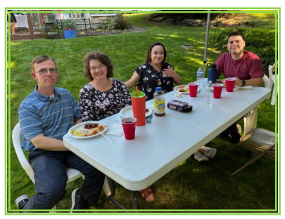
There was plenty of delicious food provided by BBC in addition to the many sides and desserts brought by those who attended.