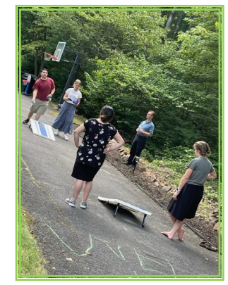
Who doesn't enjoy a good game of cornhole?