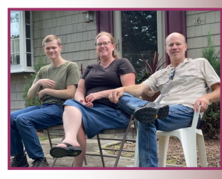
The Stebbins opted to be spectators.