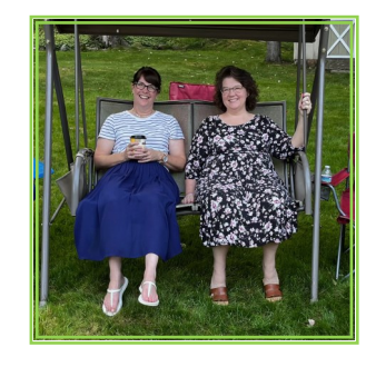
Even adults like to swing.