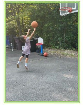
Pretty sure she made it in!