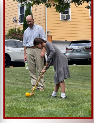
Team Hinebaugh came in a respectable 3rd place.